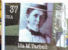
Allegheny alumna Ida Tarbell (Class of 1880) and pioneering muckraking journalist