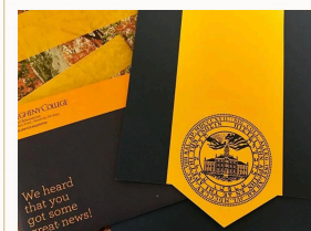
Welcome to Allegheny College!