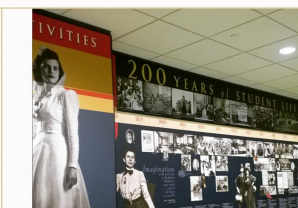
Campus Center historical display celebrating Allegheny women's achievements

Fall 2022-Spring 2023: Design and execute your legacy project as part of your evolving college portfolio.