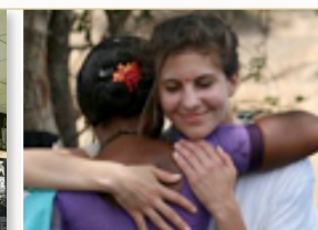
Global study abroad opportunity (Summer 2022)