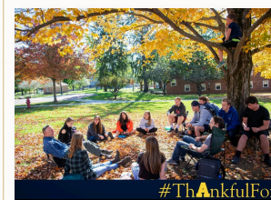
Work with your GCS cohort